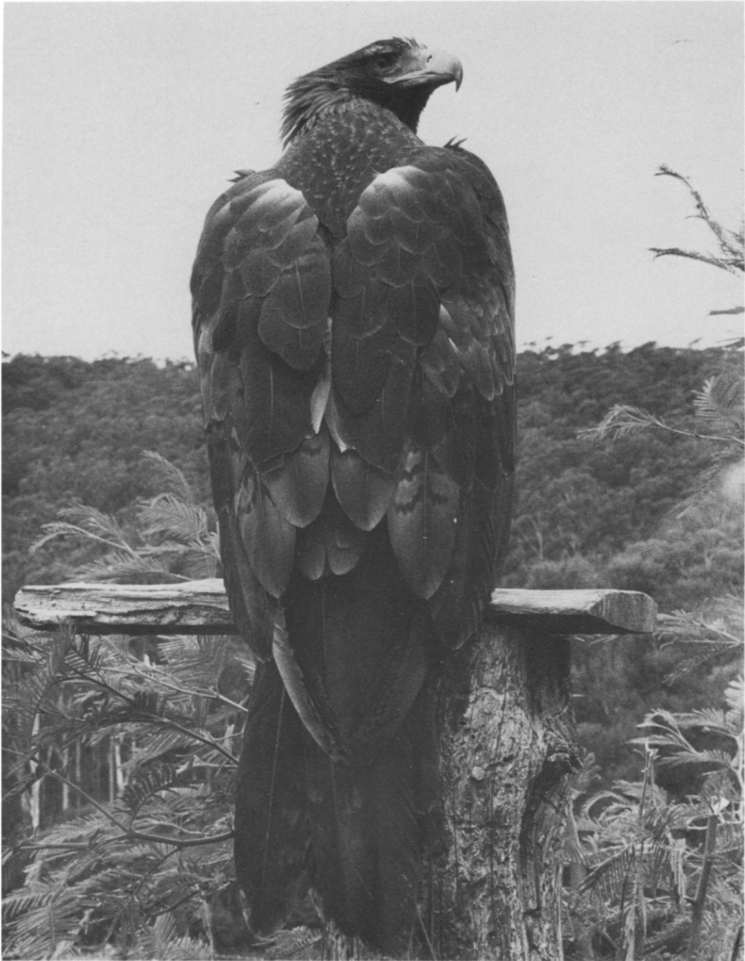
Fig. 1. The Australian Wedge-tail Eagle, Aquila audax .